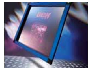
Frameless VectorGuard® Stencil Foil