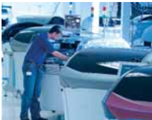
ISO9000-accredited manufacturing sites

“ GALAXY IS ENGINEERED TO DELIVER NEW LEVELS OF THROUGHPUT, YIELD, REPEATABILITY AND UTILIZATION ”