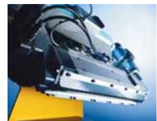
ProFlow® enclosed print head technology